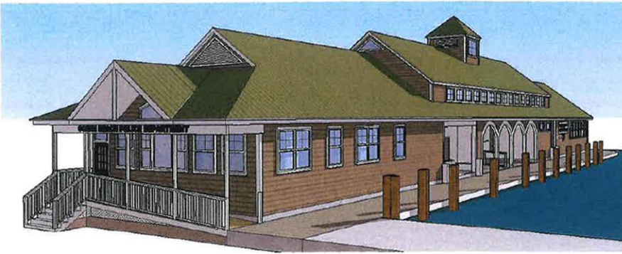
3 ISOMETRIC REFERENCE - SOUTHEAST NOT TO SCALE