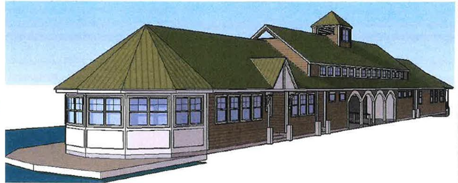
2 ISOMETRIC REFERENCE - NORTHWEST NOT TO SCALE