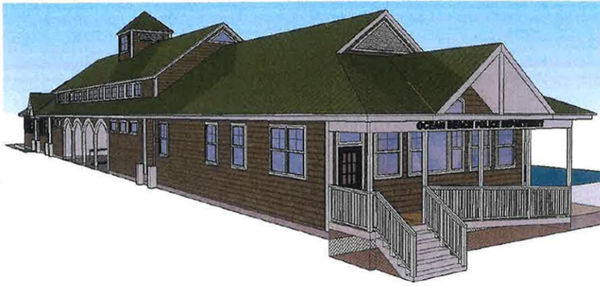
1 ISOMETRIC REFERENCE - SOUTHWEST NOT TO SCALE